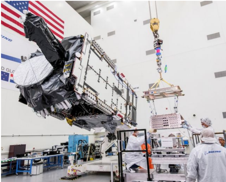
The IS-29E satellite before its 2016 launch.

While working to recover the satellite, a second anomaly occurred, after which all efforts to recover the satellite were unsuccessful, Intelsat representatives said.