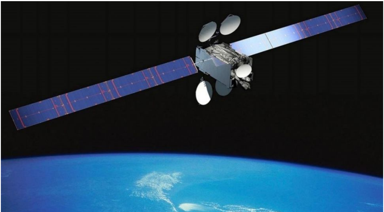
Artist's illustration of Intelsat's IS-29E satellite in orbit.

Luxembourg-based Intelsat reports that its Intelsat 29E satellite (IS-29E) is now a total loss, after having reported earlier that the spacecraft suffered an anomaly.